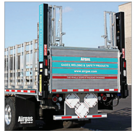
WDVBG Series Gate in stowed position offers simplicity and reduced maintenance