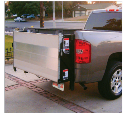
PTN Series Gate in stowed position with the optional aluminum platform

Exclusive above floor lift option will reach most dock heights