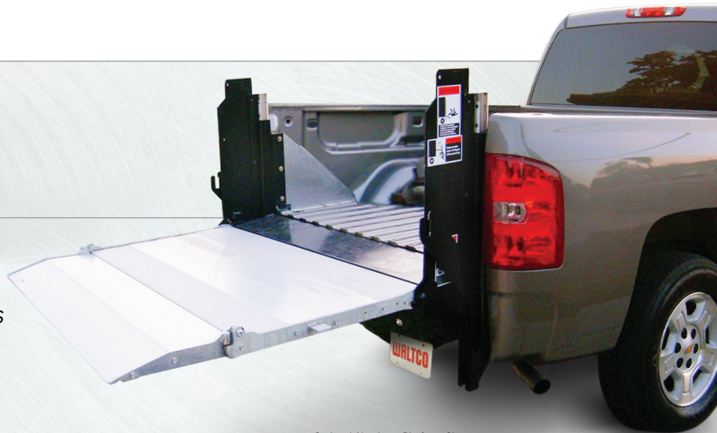
Optional Aluminum Platform Shown

Products shown may feature optional equipment. Content subject to change without notice.