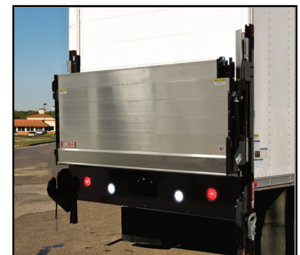
Gate shown in stowed position