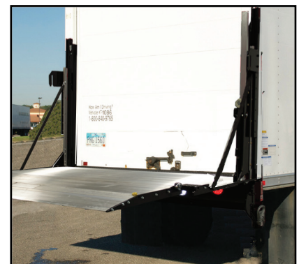
Above-floor, bed height view

Easier handling of wheeled carts, bins, and racks with this level-ride liftgate.