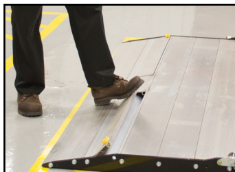
Split foot/pressure-activated cart stops