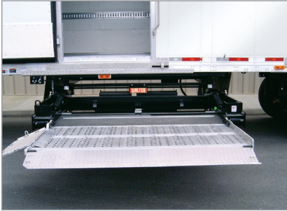
Ideal for loading and unloading in confined spaces