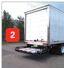
2 Powers Out from Under Trailer