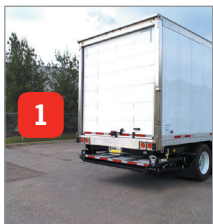
1 Stores Completely Underneath Trailer