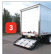
3 Manually Unfold Aluminum Extension