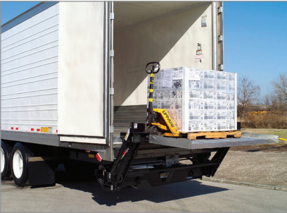
Stores completely underneath the trailer