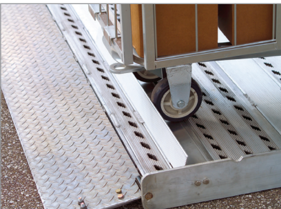
Optional Cart Stop