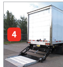
4 Liftgate Positioned for Cargo Loading