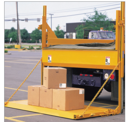
DT Series Gate in fully lowered position

Dual purpose lift can be used as a tailgate for dumping and as a platform to raise and lower material.